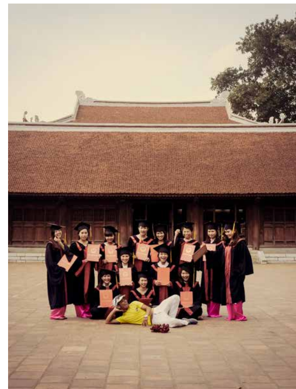
--, SAPA, VIETNAM

38 My husband is working in the fields, I come here to sell meat every weekend.